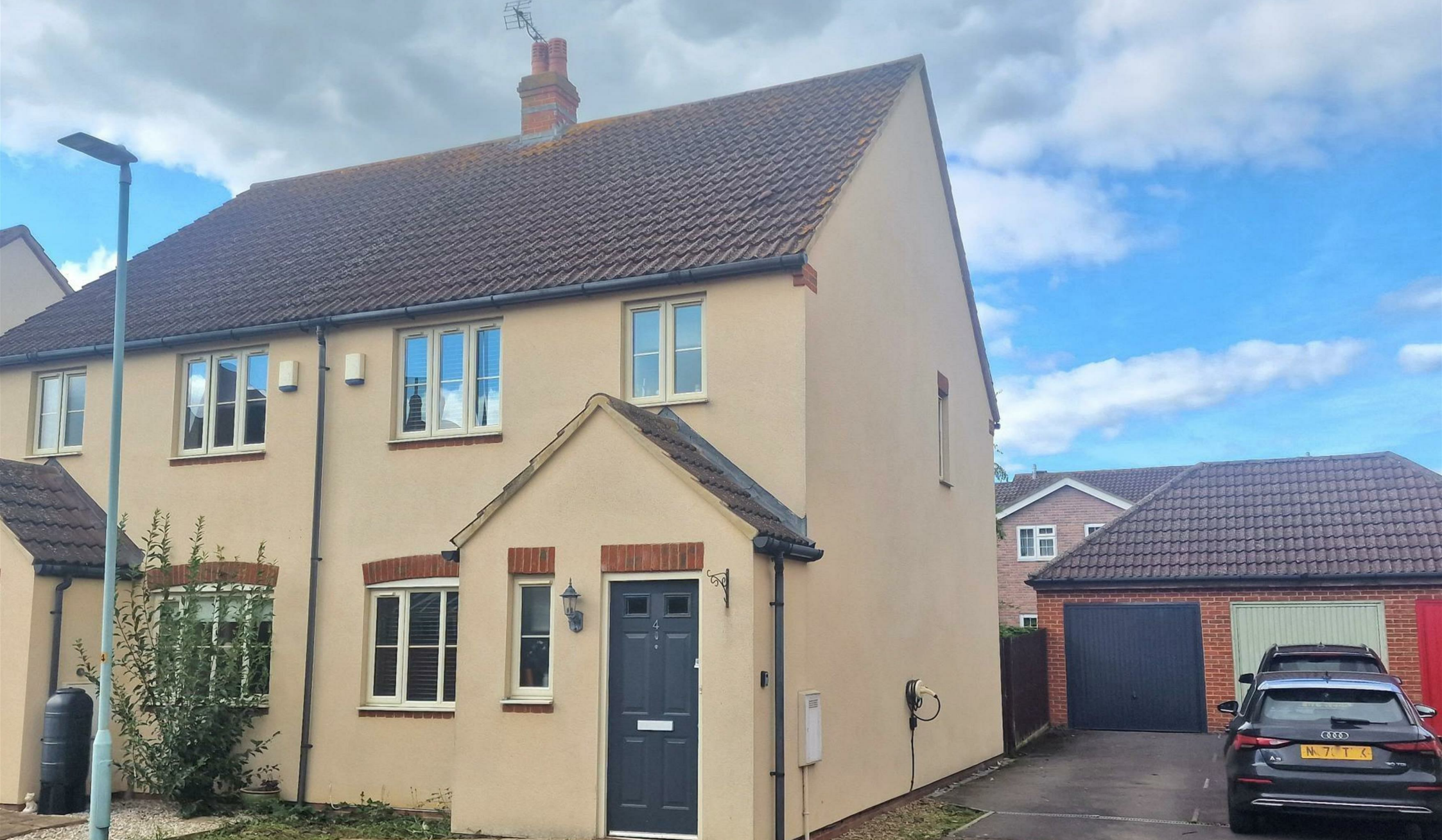
The Nurseries, Churchdown GL3 1PF £315,000